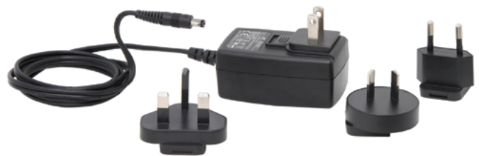
PSU-5VU Universal DC adaptor Part No: 1180 0049

Wall power adaptor with interchangeable plug for international use. Universal input: 100-240 V AC, 50-60 Hz, Output: 5 V DC, 2.5 A